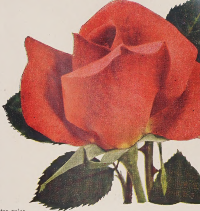
GRAND DUCHESS CHARLOTTE (Pat. Pending)

THE DOCTOR . Very fragrant rose of a lovely silvery pink. Buds are long and pointed, opening into a large rose of strong fragrance. Each $1.35